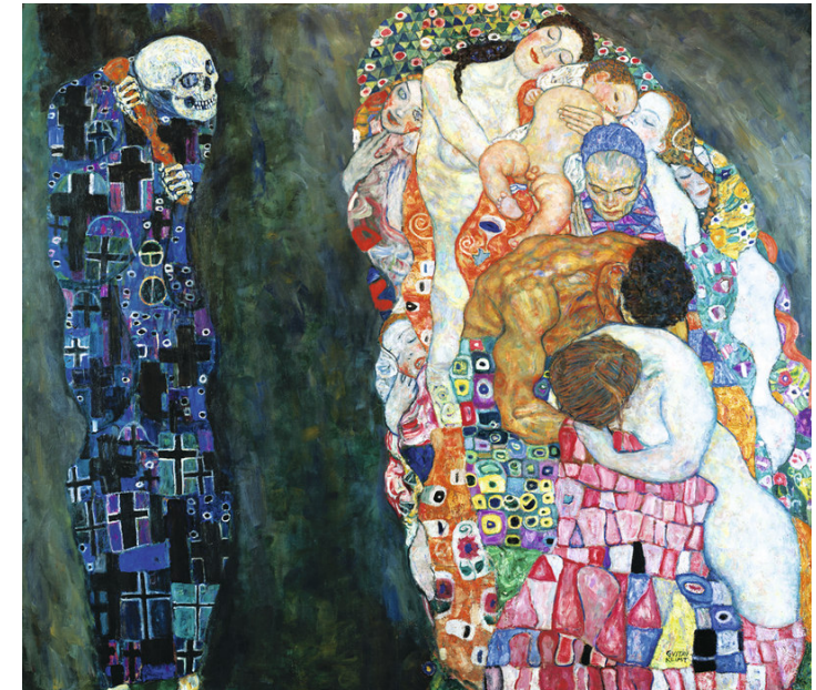
Gustav Klimt, Tod und Leben, 1910/15 © Leopold Museum, Wien, Inv. 630

The Czech Republic (Middle European) Centre for Evidence-Based Healthcare A JBI Centre of Excellence